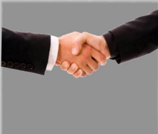
Colaboration with other companies