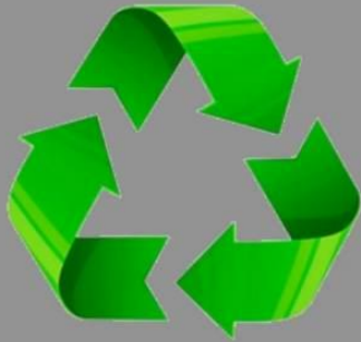
Production of other eco products