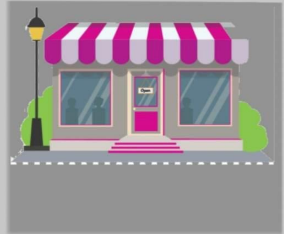
To open a shop