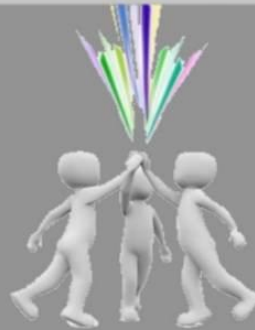
Expansion of new members