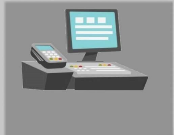
Sales in near surroundings